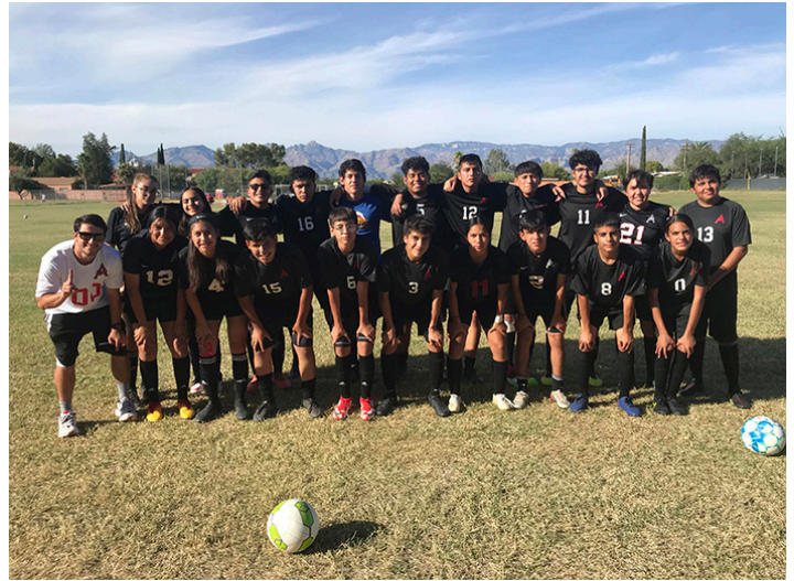
St. Augustine had never won a region title and reached the playoffs until this season.