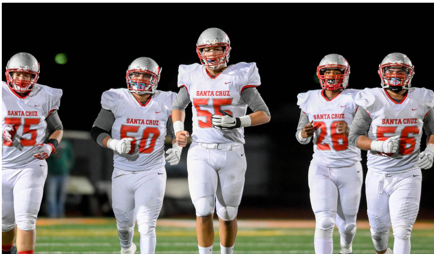
2A's preseason No. 1, Santa Cruz, is marching into this season seeking its first state title since 1980.