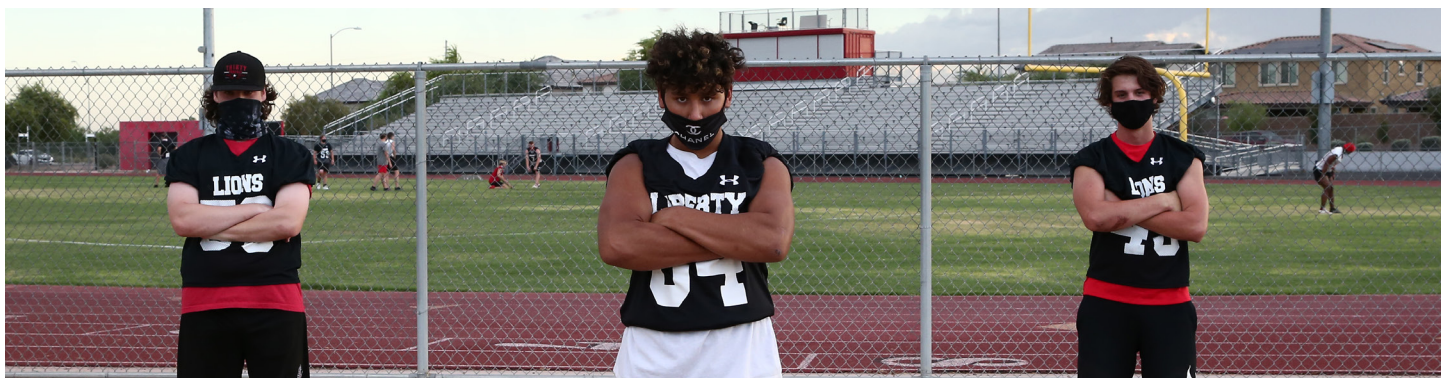
Defending 6A champion Liberty has been implementing all safety guidelines since the first day of practice.