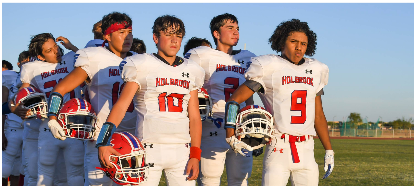
The new football realignment formula should give programs such as Holbrook a better chance to make the postseason.