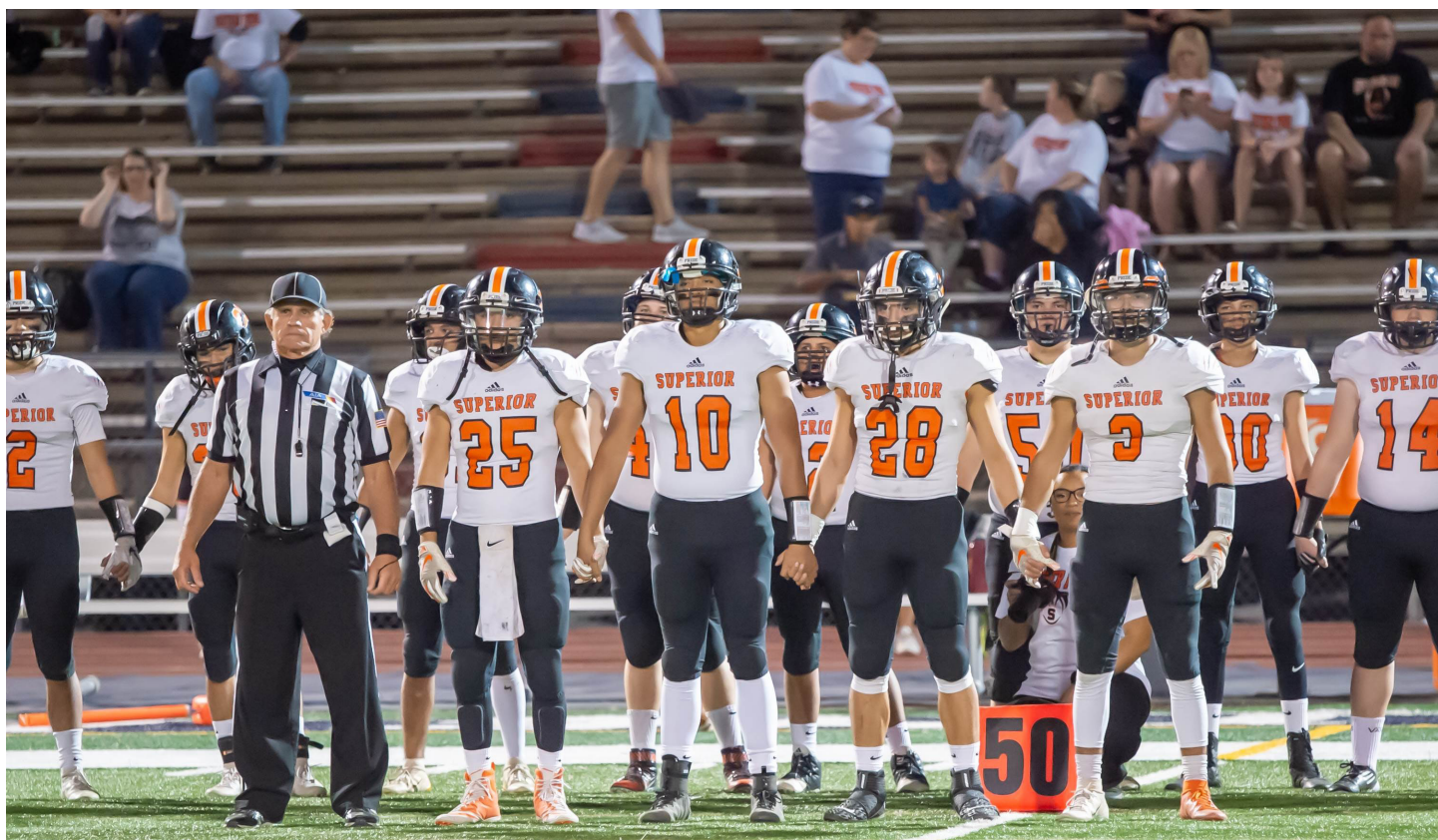
Superior's band of brothers are regrouping for another run at the 8-man crown.