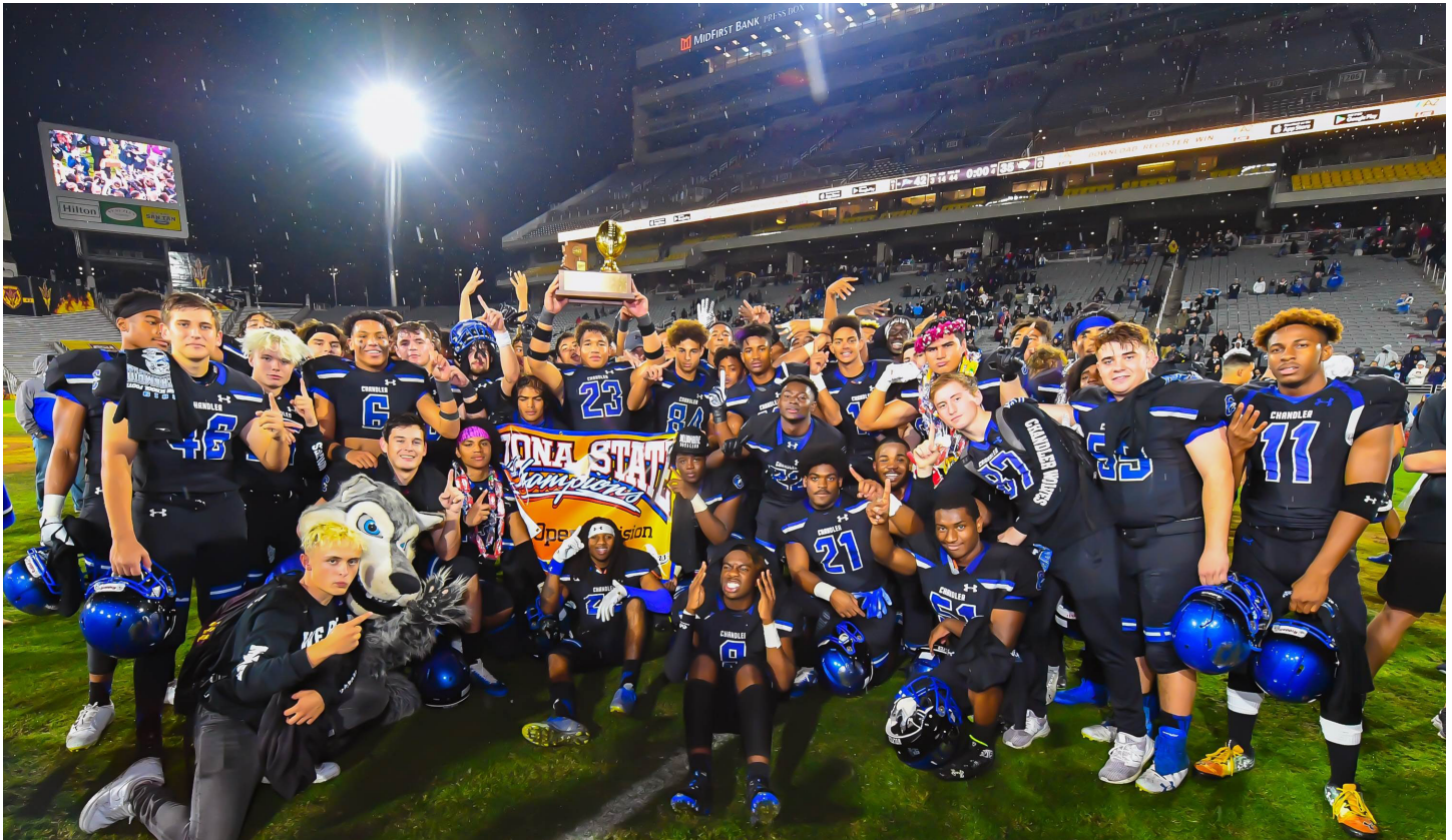
The Chandler Wolves, the defending inaugural Open Division champions, begin as the favorites in the state's biggest conference. But 6A is loaded this year after realignment.