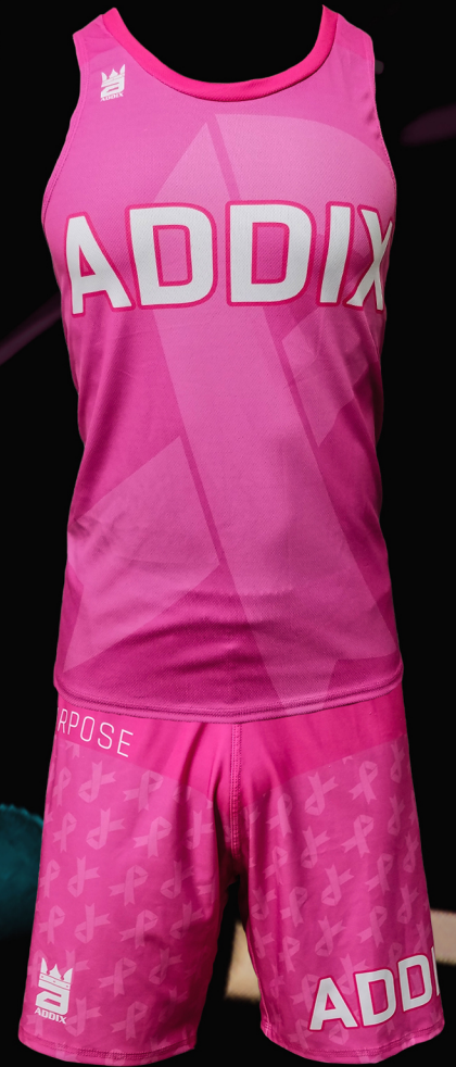
Cross Country Uniform

Start your order today call 616-987-3364 or visit www.addixgear.com