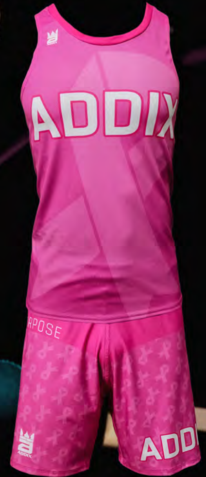
Cross Country Uniform

Start your order today call 616-987-3364 or visit www.addixgear.com