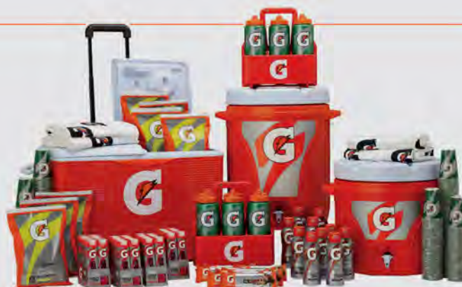
GATORADE G SERIES PERFORMANCE PACKAGE*