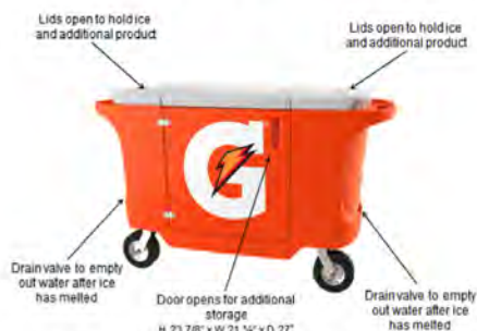
GATORADE SIDELINES CART